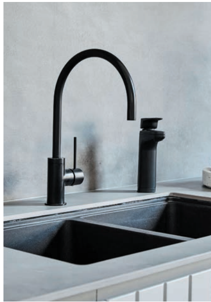
Black XL Levered Tap, plus Gooseneck Mixer Tap

Choose your preference of tap design. These systems are preferred by architects and designers for their elegant styling and space-saving features.