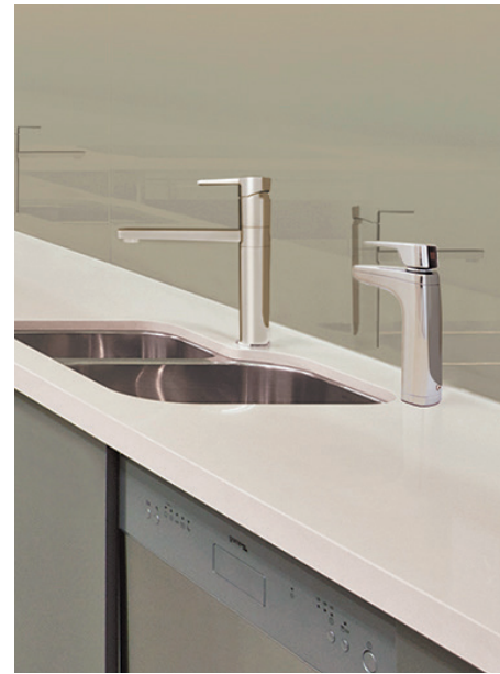
Chrome XL Levered Tap, plus Paddle Lever Mixer Tap