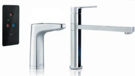
Chrome XR Remote Tap, plus Paddle Lever Mixer Tap