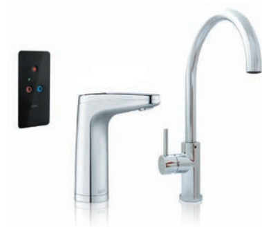
Chrome XR Remote Tap, plus Gooseneck Mixer Tap

Choose your preference of tap design. These systems are preferred by architects and designers for their elegant styling and space-saving features.